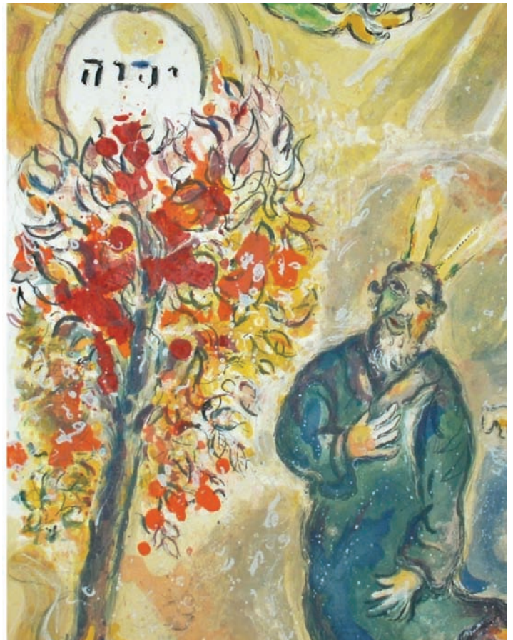
Moses and the Burning Bush —Marc Chagall